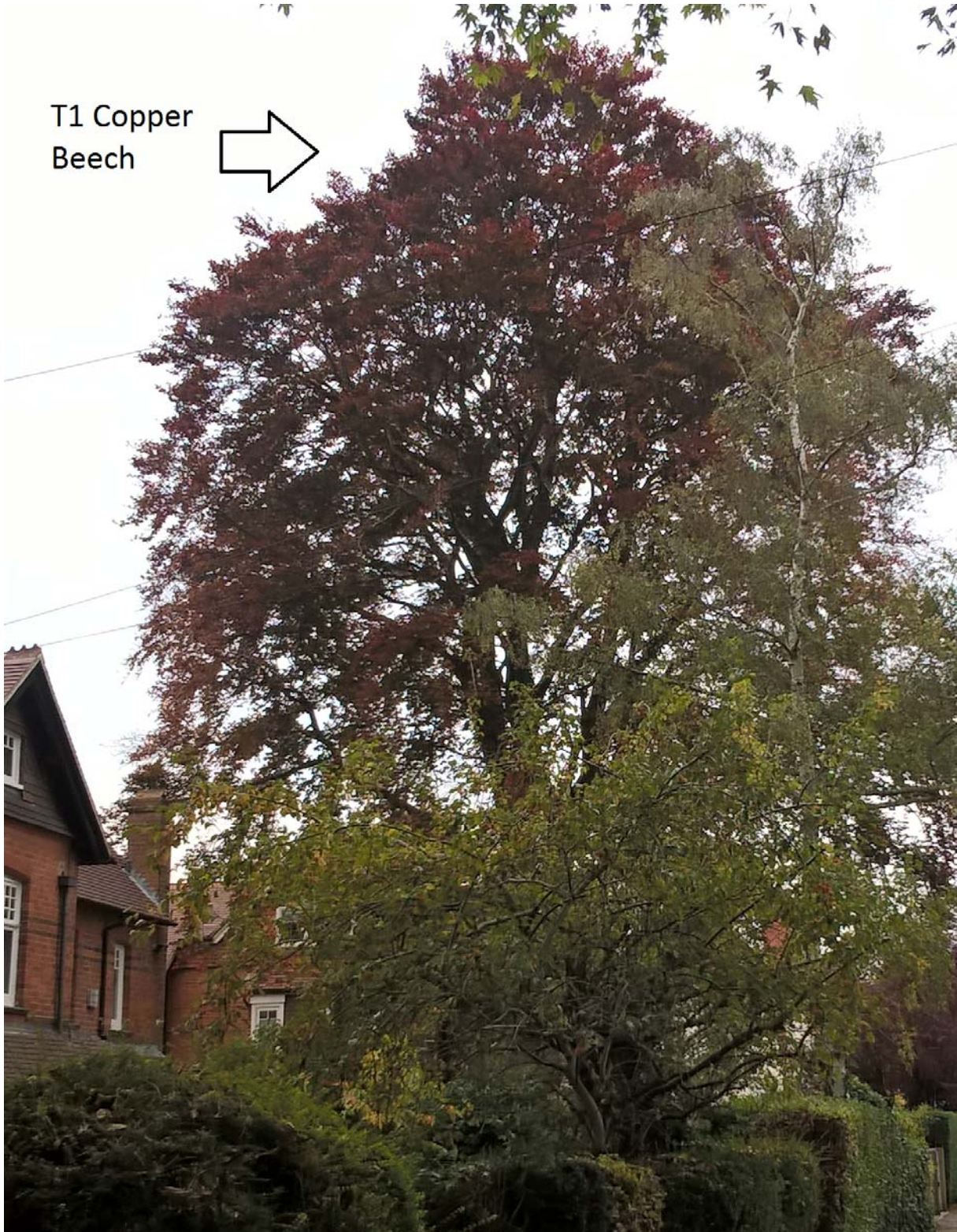
T1 Copper Beech